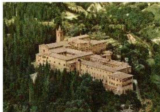
Fig. 3.2 - Archabbey of Monte Oliveto Maggiore

Bernard and his companions received the Benedictine habit and the Rule of the Father of western monasticism. Since the time of their founder Olivetans have been clothed in white. A special characteristic of the Olivetan reform is its emphasis upon the spirit of communion uniting all its houses, called to form unum corpus – one body.