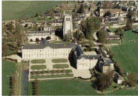
Fig. 5.1 - Abbey of our Lady of Bec-Hellouin

Founded in 1034 , at the time of William the Conqueror, Duke of Normandy and King of England, the Abbey of Bec had as its first Abbot its founder, Herluin . Herluin began as a hermit, but very soon he was joined in his monastic solitude by a group of disciples; among them was Lanfranc (1042) schoolman and builder, and St. Anselm (1059) philosopher and spiritual master (both became Archbishop of Canterbury).