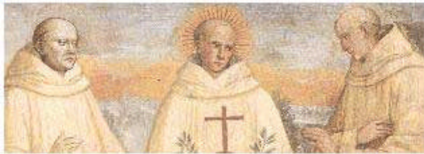
Fig. 3.1 - 3 Founders: Patrick Patrizi, Bernard Tolomei and Ambrose Piccolomini. ( Fresco 15th Century. Monte Oliveto Maggiore )

Blessed Bernard Tolomei, founder of the Archabbey of Monte Oliveto Maggiore , Italy, was born in Siena 1272. He was educated as a nobleman of the Tolomei family and had a distinguished career as a lawyer. At around the age of forty, he felt called to a radical living out of his Christian vocation.