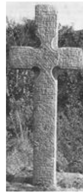
Fig. 6.1 - St. Bronagh's Cross

St. Bronagh, patron of Kilbroney, is celebrated on the 2nd of April .